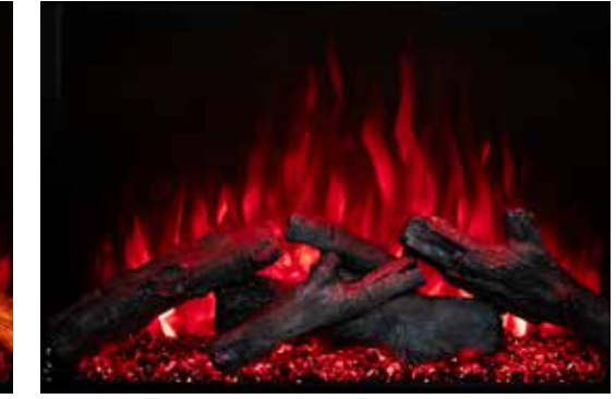
Red Flames - Logs off