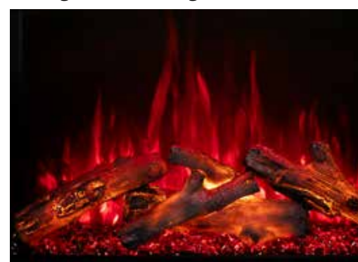
Red Flames - Logs on