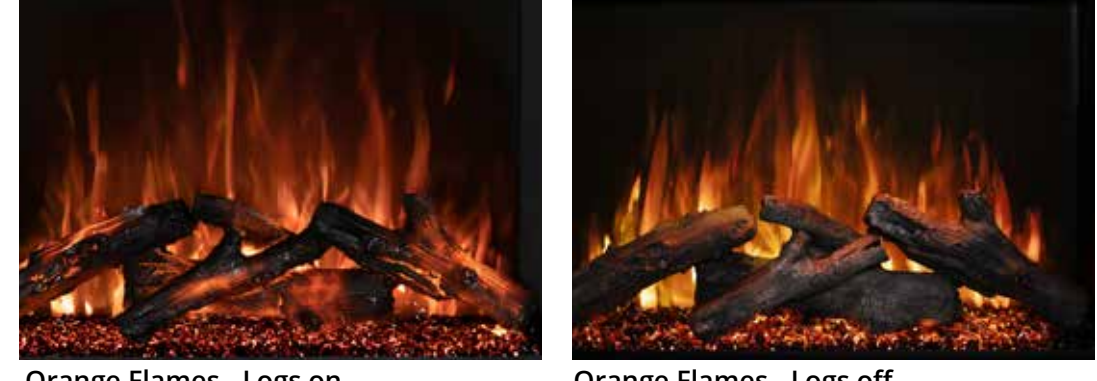
Orange Flames - Logs on