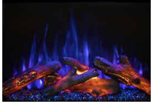
Blue Flames - Logs on